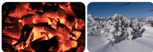
Figure 3.10.1: The glowing charcoal on the left represents high kinetic energy, while the snow and ice on the right are of much lower kinetic energy.

The concept of temperature may seem familiar to you, but many people confuse temperature with heat. Temperature is a measure of how hot or cold an object is relative to another object (its thermal energy content), whereas heat is the flow of thermal energy between objects with different temperatures. Temperature is a measure of the average kinetic energy of the particles in matter. In everyday usage, temperature indicates a measure of how hot or cold an object is. Temperature is an important parameter in chemistry. When a substance changes from solid to liquid, it is because there was an increase in the temperature of the material. Chemical reactions usually proceed faster if the temperature is increased. Many unstable materials (such as enzymes) will be viable longer at lower temperatures.