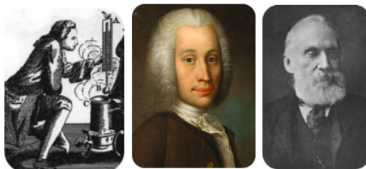
Figure 3.10.2: Daniel Gabriel Fahrenheit (left), Anders Celsius (center), and Lord Kelvin (right).

Three different scales are commonly used to measure temperature: Fahrenheit (expressed as ^{\circ}\text{F} ), Celsius ( ^{\circ}\text{C} ), and Kelvin (K). Thermometers measure temperature by using materials that expand or contract when heated or cooled. Mercury or alcohol thermometers, for example, have a reservoir of liquid that expands when heated and contracts when cooled, so the liquid column lengthens or shortens as the temperature of the liquid changes.